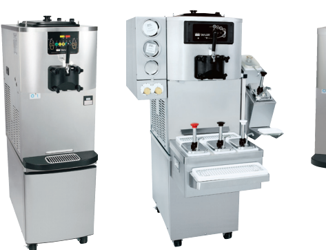
Optional Cart with front opening door